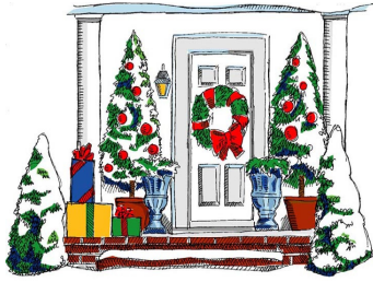
Holiday House Tour